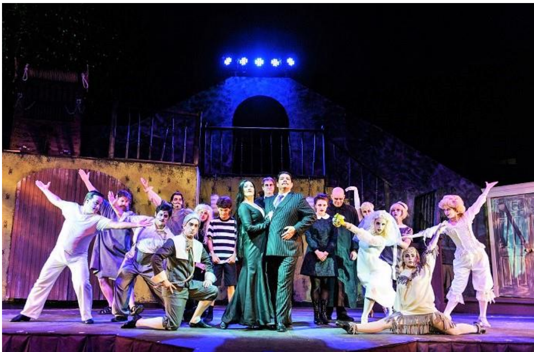
Annapolis Summer Garden Theatre performs Addams Family.

The venue itself is a lot like many of the musicals performed upon its stage: full of commitment, characters, history, determination, dreams and true grit. This a theatre unlike any other in Annapolis.