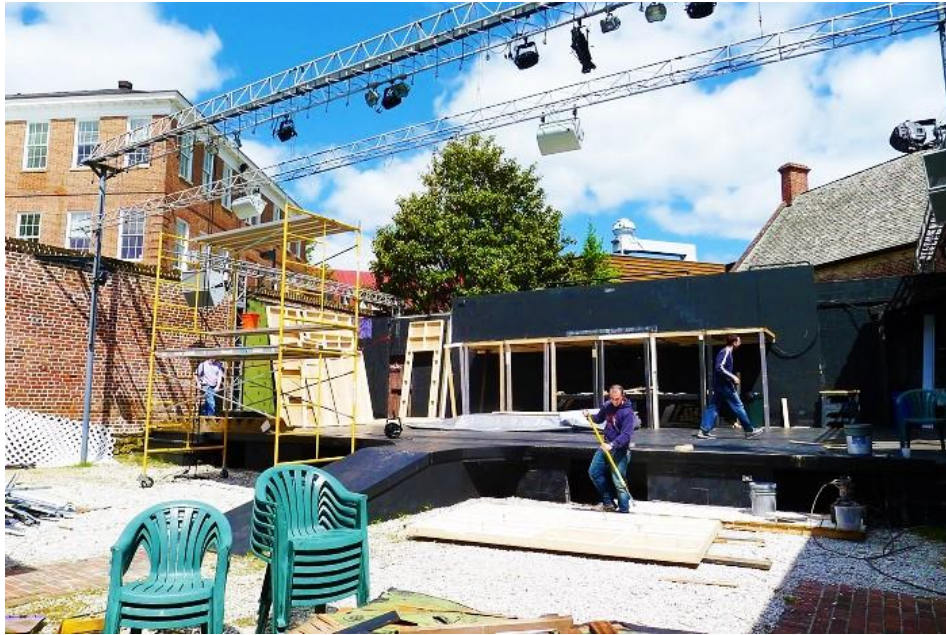
Preparing for opening of summer theatre.

First, let me explain for those who don't realize what the summer part of ASGT is all about and why it hibernates during the winter. This is a building, with a front in possession of a roof. But that's the front of the house. The rear – no roof. This is theatre under the stars. Looking at the façade, which appears very much at home in historic downtown Annapolis, you really have no idea what awaits beyond the door.