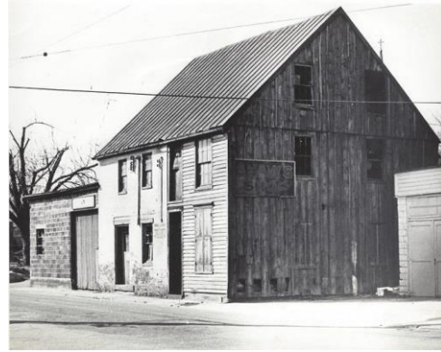
Shaw's Shop in the 1960s.