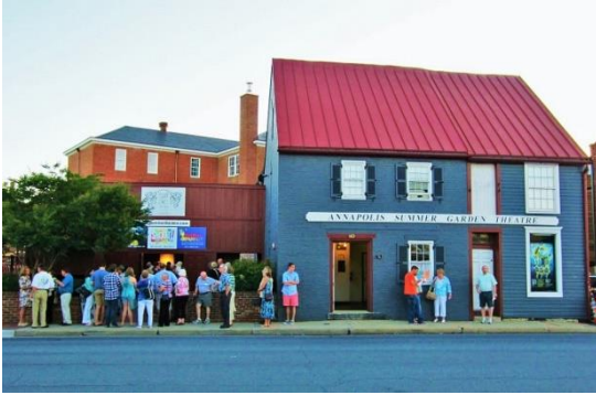
Audience waits to enjoy a performance.