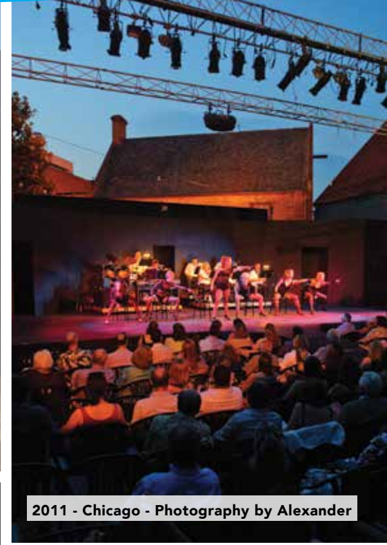
2011 - Chicago